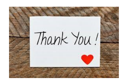
Thank you to all who volunteered to help with commodities distribution!